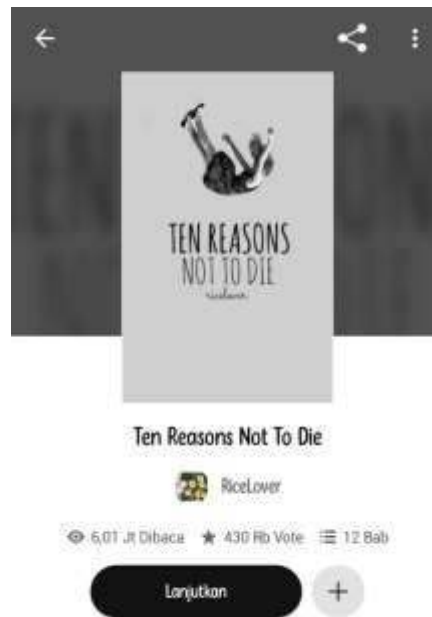
Figure 3.2 View Stories on Wattpad