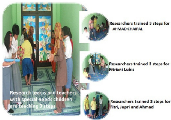
Figure 7. Teaching 3 Steps

amount of patience, as well as the force to instill discipline, in order to ensure that the children followed orders. This exercise helped discern the objective that musical drama can help children work with people around them and also improve their creativity.