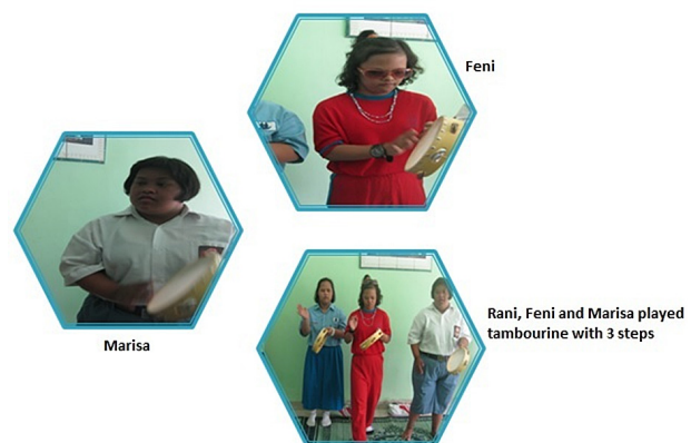
Figure 4. Children trained to play Rhythm on a Tambourine with 3 steps