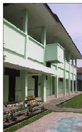
Figure 1. Image of the YPAC Building Medan 2015

donation of land area of 4,574 m. at No. 2 Adinegoro, Medan from the city's mayor Dr. Syurkani. The Medan Branch of the YPAC confirmed its establishment on February 5, 1972 through the decree of the Board of Foundation No. 19 / SK / PH / YPAC / 85. In accordance with Law Decree No. 16 of 2003 regarding the foundation, the Medan Branch of the YPAC changed its status to the YPAC in Medan based on the notarial deed of Henry Tjong, SH No. 31 dated February 18, 2004 (Brochure YPAC [Ibid.]). The YPAC slogan is "Disability Does Not Determine the Capabilities of Anyone." The YPAC Medan trainers are provided with comprehensive services in the institution, namely, the Child Rehabilitation Center (PRA) (according to the YPAC Brochure [Ibid.]).