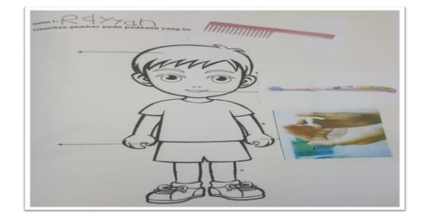
Figure 2 : attempted to write name and able to match correctly