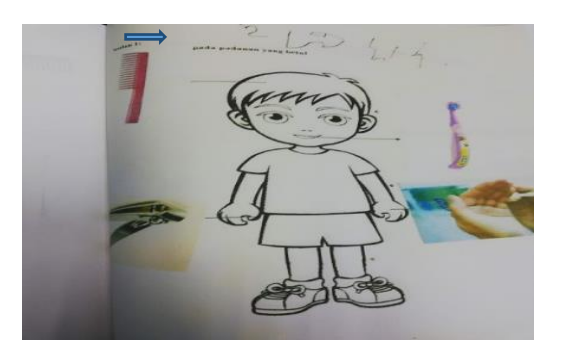
Figure 1 : unable to write name but able to match correctly

The researchers found the study useful for children under 6 years of age. It is able to educate these children to engage in the importance of their level of personal hygiene. Pedagogy Theatre allows the children to warm up and be impulsive as well as to share their own ideas. The children shared their thoughts on wanting to meet/ play with their super heroes (Ultraman, Iron man) after having brushed their teeth and the researchers found this to be of positive outcome of the study as the children have expressed a desire to be clean for someone they like. The children were able to answer were able to read or write their own name.